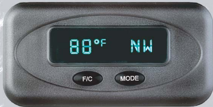
vacuum fluorescent COMPASS/OUTSIDE TEMPERATURE DISPLAY p/n AT-COMP-01 DASH MOUNT COMPASS KIT