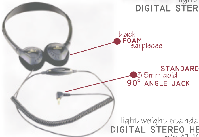
light weight standard DIGITAL STEREO HEADPHONES p/n AT-101-03