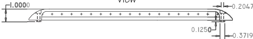
bottom view of BOSS indicate round NOT SQUARE

One look is all it takes to see the value that will be added to your truck topper, cargo trailer, recreational or specialty vehicle. With S.A.E. approval, applications are endless!