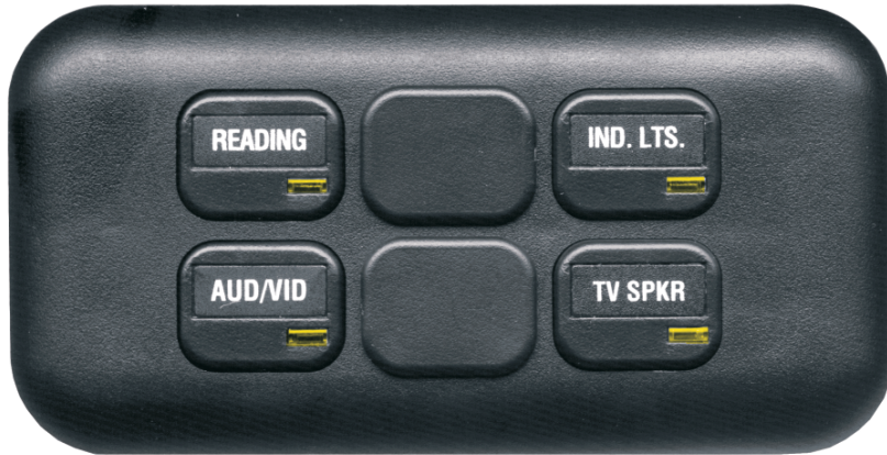
backlit text PUSH BUTTON control panels

The 6000 Switch System utilizes the new large button switch controls. These automotive styled backlighted switch control systems will leave everything else in the dark.